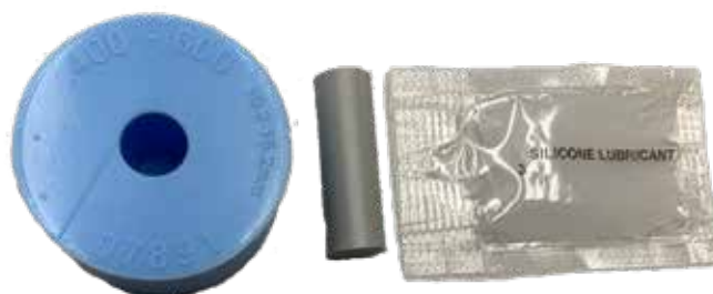
Example grommet - single-hole grommet shown