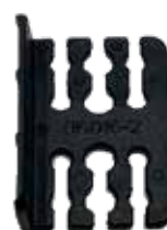
buffer tube retainer clip