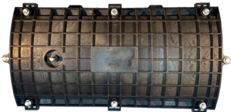
enclosure with cover closed