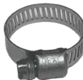
hose clamp for cable retention