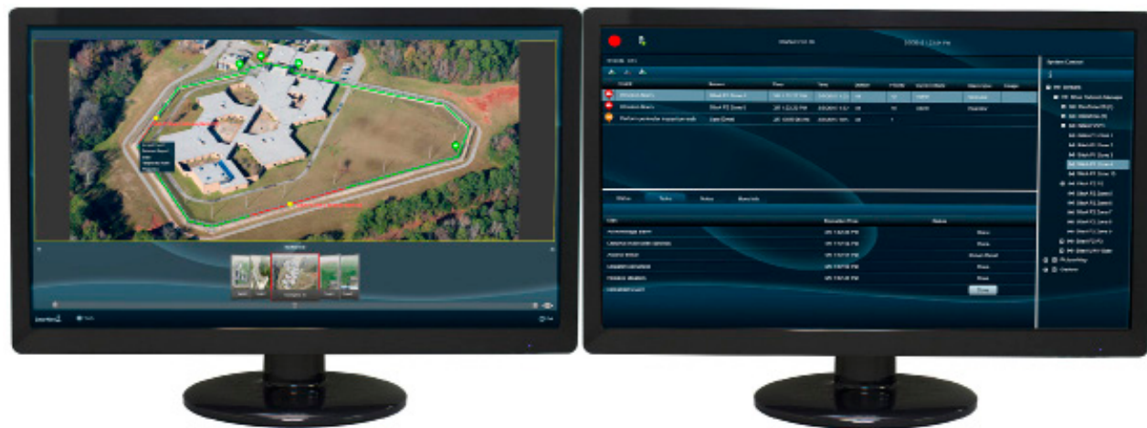
Dual monitor operator interface

For infrequently used gates, a quick-disconnect kit enables the cable to be installed in a contiguous run across the gate while still enabling the gate to be opened when required.