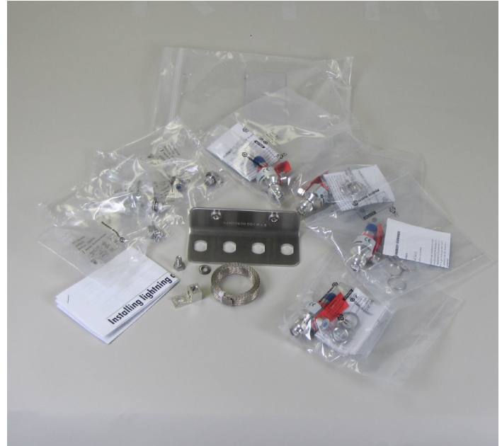
Lightning Supression Kit Contents