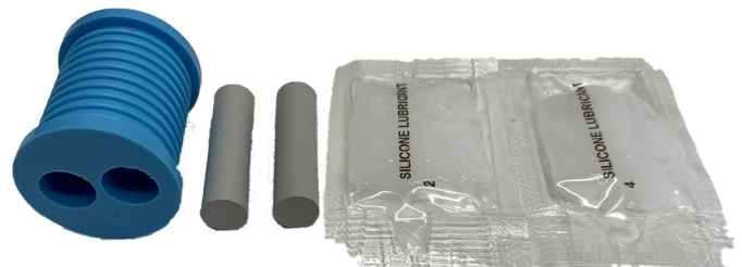
Dual-hole grommet for 1.0" cable port