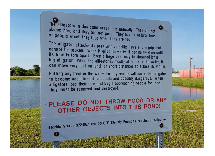
Sign at the site warning of alligators

FiberPatrol now successfully secures the site's entire perimeter – fence and culverts, safeguarding the site from intruders and intruders from alligators.