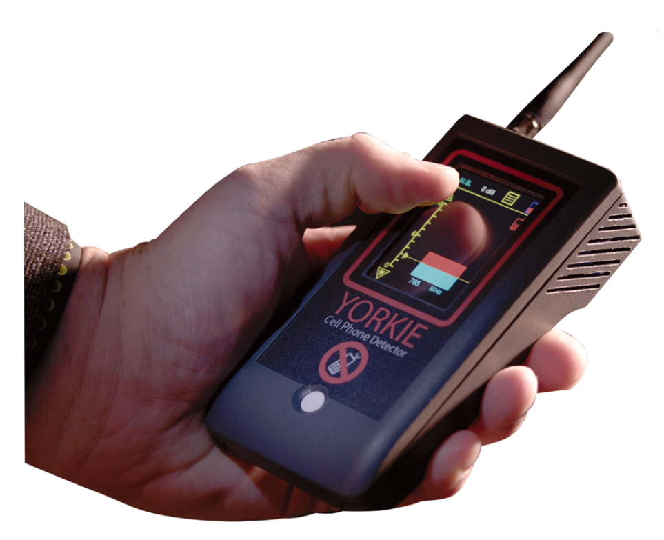
Berkeley Varitronics Systems' Yorkie cell phone detector is covert and pocket sized.

phones emit energy which contains a specific signature that is unique and can be identified among many other typical wireless energy sources. This allows correctional officers to identify an active nearby cell phone rather than an active nearby guard's walkie talkie for example, Schober says. "Yorkie is a cell phone detector that can be discreetly operated from inside any pocket to deliver alerts to guards without alerting the prison population. The receiver detects voice, texting and data use over 100 feet away and even a phone that is on but not being used." When coupled with a directional-finding antenna, sensitive receivers such as Wolfhound-Pro detect cell phones up to 200 feet away and also allow security personnel to locate the phone and its user.