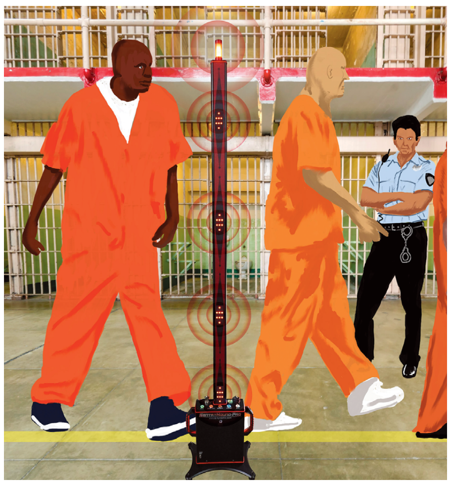
The Sentryhound-Pro from Berkeley Varitronics Systems Inc. detects contraband cell phones on or off.

This advertisers index is provided as a service to our readers only. The publisher does not assume liability for errors or omissions.