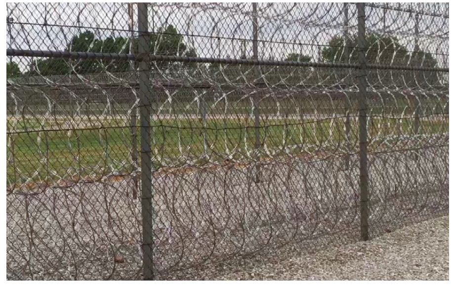
Senstar's FlexZone locating intrusion detection sensor reduces contraband introduction through intrusion.

He adds that employing multiple screening technologies is the recommended way to go. "The