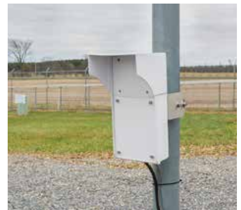
UltraWave microwave sensor

To protect against deliberate spoofing or accidental mis-alignment, receiver units only recognize their paired transmitter unit. Signal loss or jamming attempts are also reported.