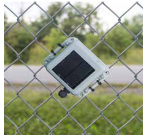
FlexZone Wireless Gate Sensor Module