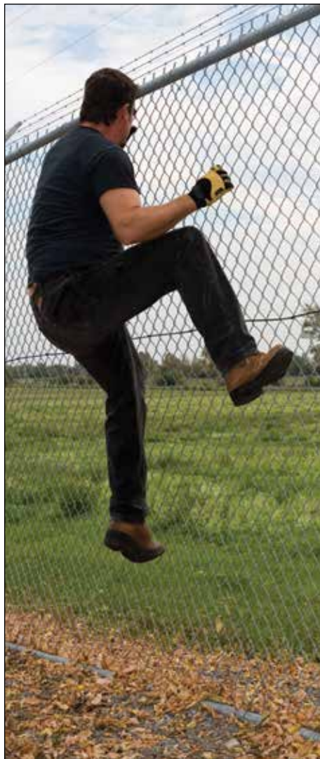
Intruder on a fence