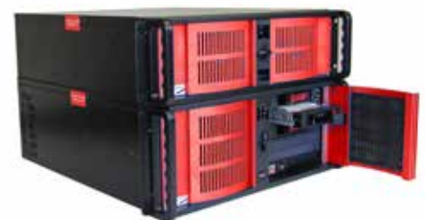
FiberPatrol-ZR sensor unit

The advanced detection algorithm incorporates thresholds, spatial parameters and timing parameters. Detection settings include alarm threshold, disturbance threshold, event life persistence and duration threshold.