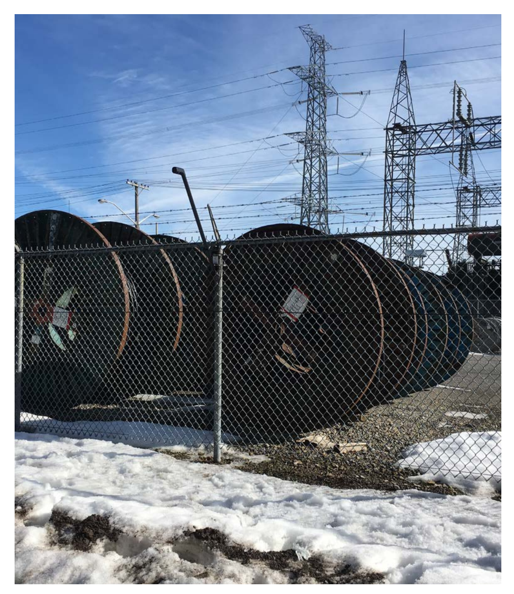
Senstar LM100 Hybrid Perimeter Intrusion Detection and Intelligent Lighting System protecting an electrical storage yard.