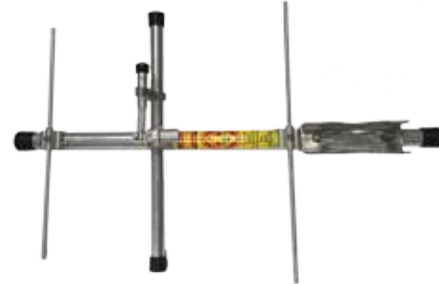
Yagi outdoor antenna